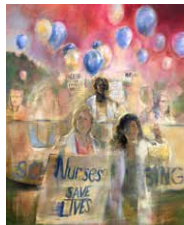
Marching to Save the School