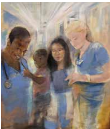
The Art and Science of Nursing

“It was a big body of work. No doubt about it. A lot of paint and a lot of brushes were sacrificed in the creation of these pictures.”