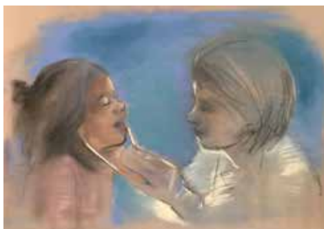
Caring for Children: Listening is Key