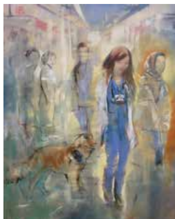
70 Years Educating Nurses