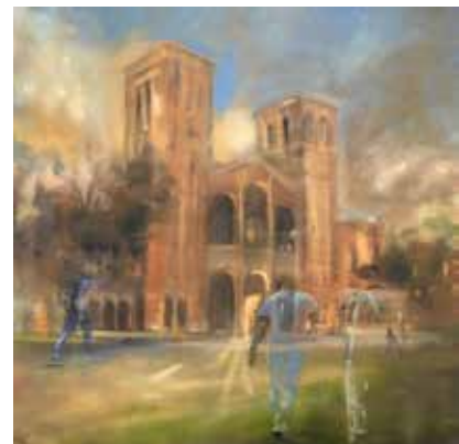
Royce Hall Where it All Began