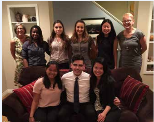
Previous Night with Nine Nurses event