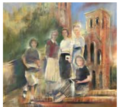
UCLA Beginnings 1950